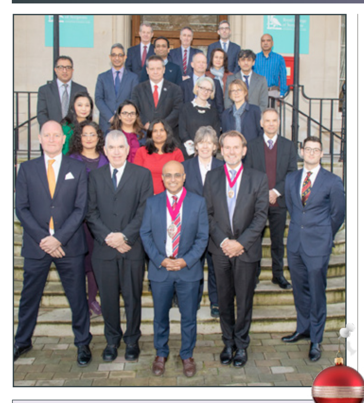
The Presidential Handover